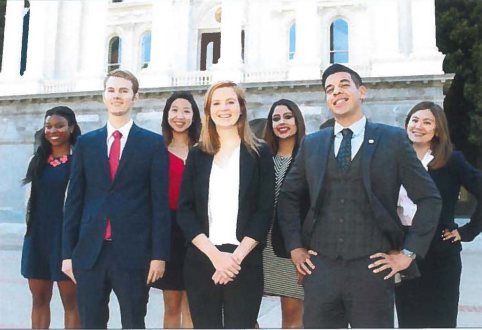
UCCS will help you find your internship in

As a UCCS student, you will intern, take academic courses, network and participate in professional development activities in Sacramento for the quarter or semester. Earn 14 quarter units or 13 semester units. Remain financial aid eligible!